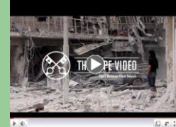
Eliminate Arms Trade

Apostleship of Prayer receives monthly prayer intentions from the Pope and urges Christians throughout the world to unite in prayer for those intentions. Each month Pope Francis will film his monthly prayer intention and it will be distributed on social media. Check back for a new video on the next month's prayer intention.