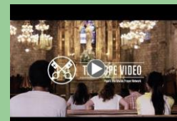
Parishes at the service of mission

Apostleship of Prayer receives monthly prayer intentions from the Pope and urges Christians throughout the world to unite in prayer for those intentions. Each month Pope Francis will film his monthly prayer intention and it will be distributed on social media. Check back for a new video on the next month's prayer intention.