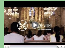
Parishes at the service of mission

Apostleship of Prayer receives monthly prayer intentions from the Pope and urges Christians throughout the world to unite in prayer for those intentions. Each month Pope Francis will film his monthly prayer intention and it will be distributed on social media. Check back for a new video on the next month's prayer intention.