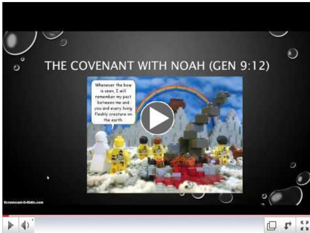
Symbolon Excerpt: The Story of Salvation