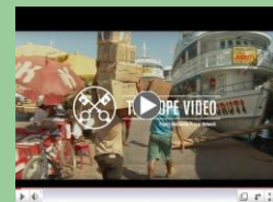
Rights of workers and the unemployed

Apostleship of Prayer receives monthly prayer intentions from the Pope and urges Christians throughout the world to unite in prayer for those intentions. Each month Pope Francis will film his monthly prayer intention and it will be distributed on social media. Check back for a new video on the next month's prayer intention.