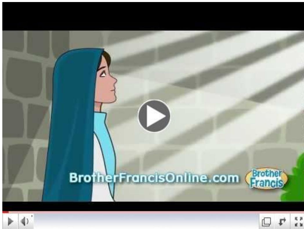
The Parts of the Mass: The Creed