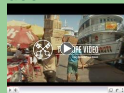
Rights of workers and the unemployed

Apostleship of Prayer receives monthly prayer intentions from the Pope and urges Christians throughout the world to unite in prayer for those intentions. Each month Pope Francis will film his monthly prayer intention and it will be distributed on social media. Check back for a new video on the next month's prayer intention.