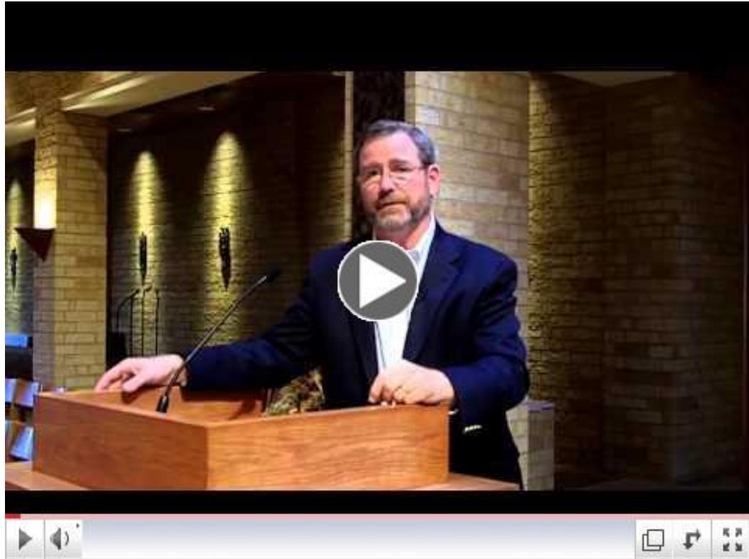
Being Catholic Is Cool: U.S. Catholic Catechism for Adults