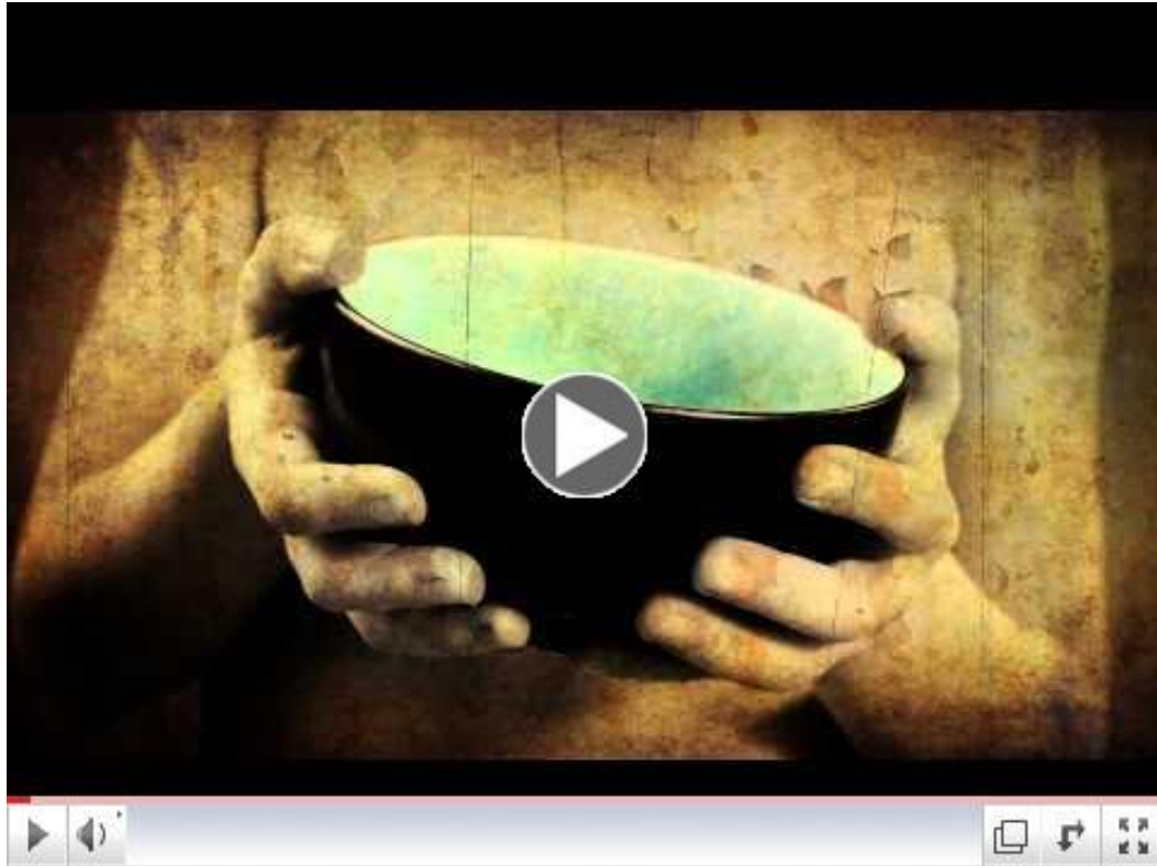
The Image of God