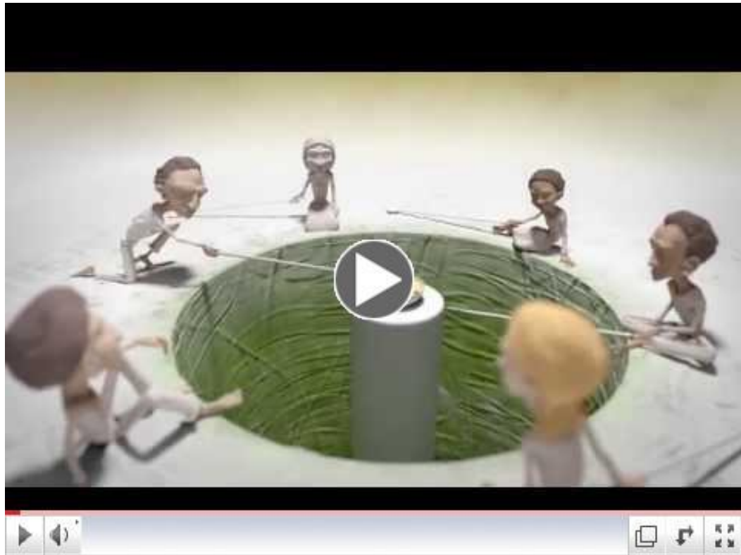
DOs & DONTs of the Corporal Works of Mercy (Lifeteen)