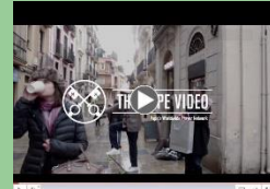
Welcome the Needy- February 2017

Apostleship of Prayer receives monthly prayer intentions from the Pope and urges Christians throughout the world to unite in prayer for those intentions. Each month Pope Francis will film his monthly prayer intention and it will be distributed on social media. Check back for a new video on the next month's prayer intention.