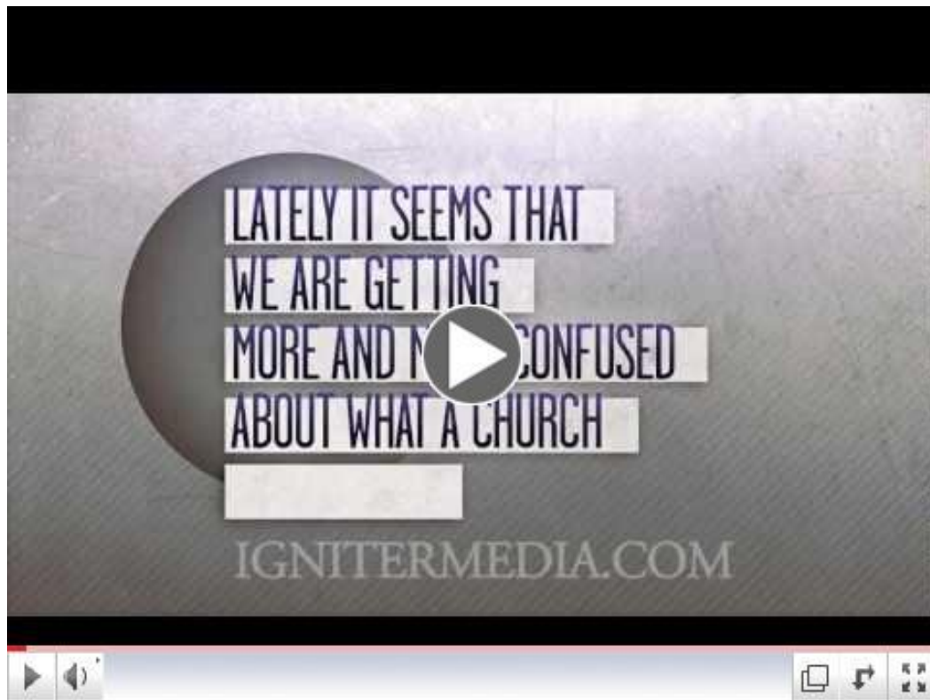
Bishop Barron on The Holy Spirit in the Life of the Church