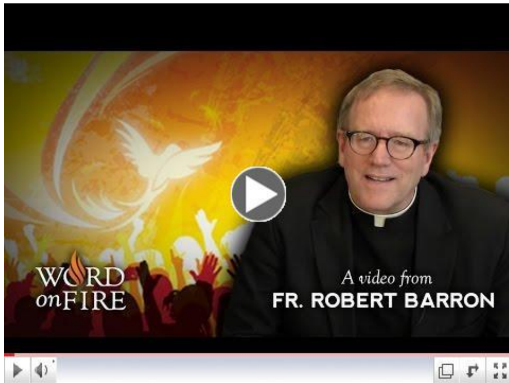
Pentecost in 2 Minutes