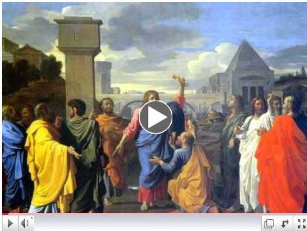
Bishop Barron on Papal Infallibility