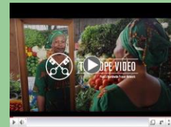
Christians in Africa

Apostleship of Prayer receives monthly prayer intentions from the Pope and urges Christians throughout the world to unite in prayer for those intentions. Each month Pope Francis will film his monthly prayer intention and it will be distributed on social media. Check back for a new video on the next month's prayer intention.