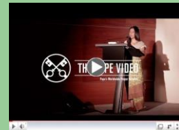
July-Respect for Indigenous Peoples

Apostleship of Prayer receives monthly prayer intentions from the Pope and urges Christians throughout the world to unite in prayer for those intentions. Each month Pope Francis will film his monthly prayer intention and it will be distributed on social media. Check back for a new video on the next month's prayer intention.