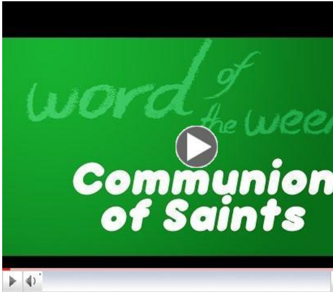
All Saints Day Pep Talk