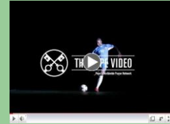
August-Sports, a Culture of Encounter

Apostleship of Prayer receives monthly prayer intentions from the Pope and urges Christians throughout the world to unite in prayer for those intentions. Each month Pope Francis will film his monthly prayer intention and it will be distributed on social media. Check back for a new video on the next month's prayer intention.