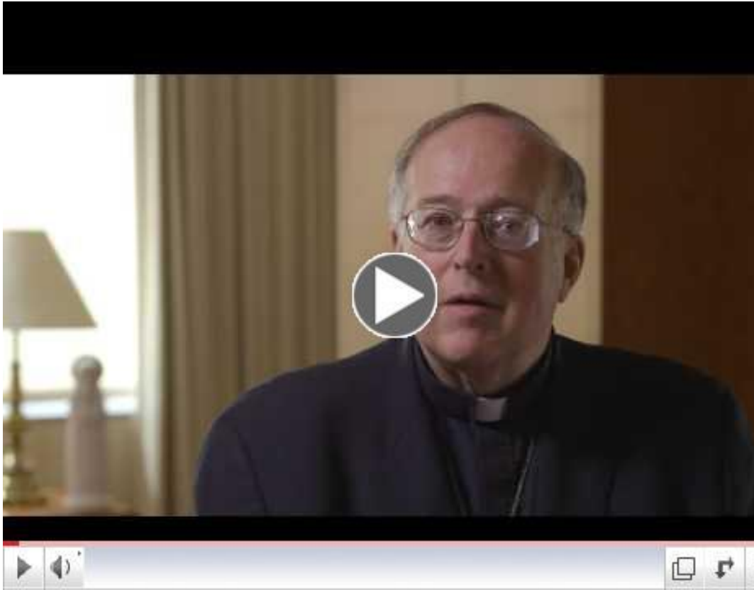
Bishop Barron on Keith Richards, Bob Dylan, & Evangelization