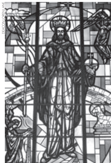
Christ the King is depicted in stained glass in an upper window of the church.